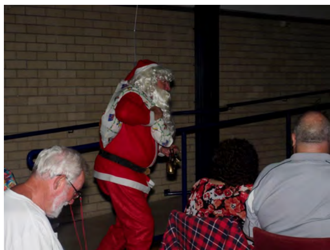
Look who turned up at the December meeting. The one and only Santa bearing gifts for all.

Temporarily suspended until further notice