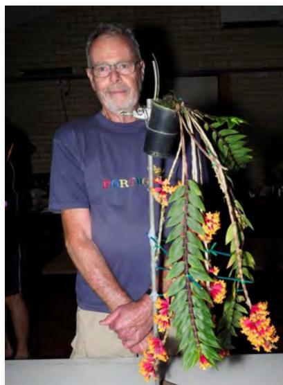
Open Orchid of the night - Den. Lawesii -- Brian Phelan