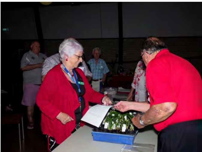
Members collecting their new Growing Comp. plant.