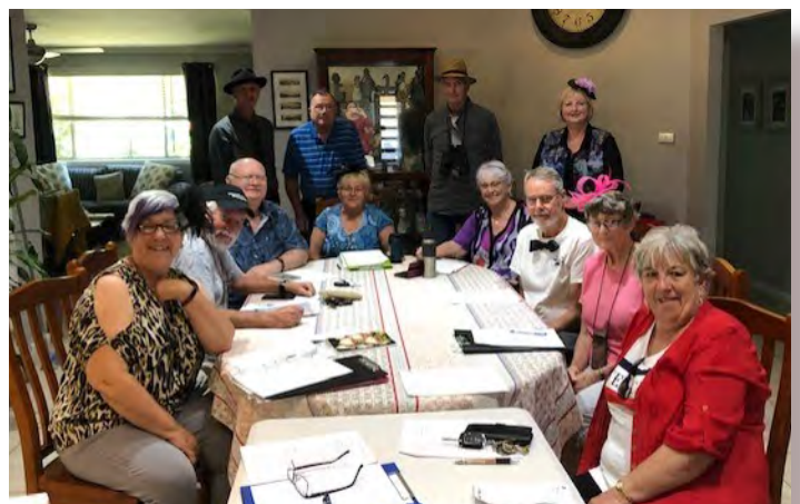
Melbourne Cup Committee afternoon tea .

There will be no orchid sales on the sales table on auction night.