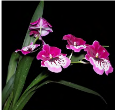
Intermediate Orchid of the Night - Mltps. Lila Fearneythough #10 - Francoise Sikora