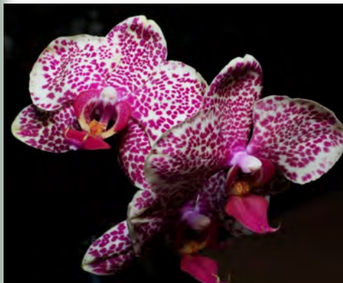
Seedling - Phal. Ox Red Sesame 1699 -- Ron Findlater