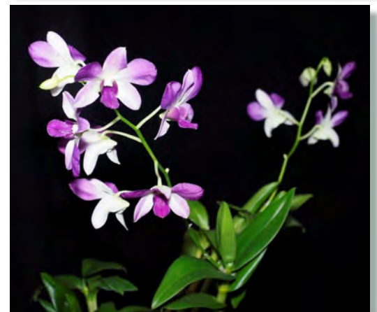
Orchid Hybrid of the Night - Den. Aridang Blue -- Yvonne Young