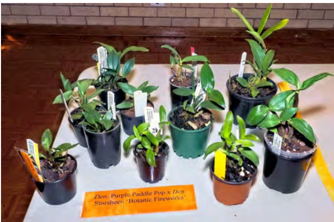
Growing Competition - Den. Aust. Obsession 'Purple paddle Pop' x Den. Starsheen 'Botanic fireworks'