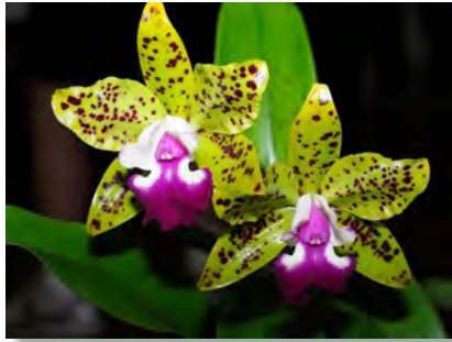
Orchid Hybrid of the Night = C. Siamese Dell 'Kiwi Fruit'