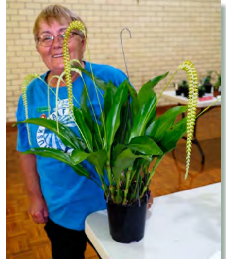
Orchid Species of the Night - Dendrochilum macranthum