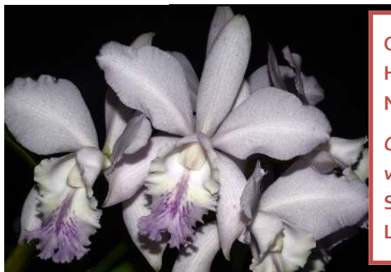
October Hybrid of the Night C. intermedia var. coerulea x Sea Breeze L. Gannon