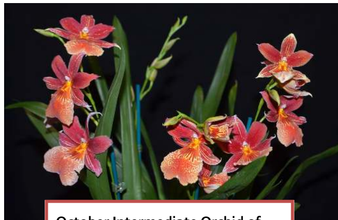
October Intermediate Orchid of the Night

110 SHOP 6 KALANDAR ST EAST NOWRA NSW 2541 PH 02 44223438 FAX 02 44223869