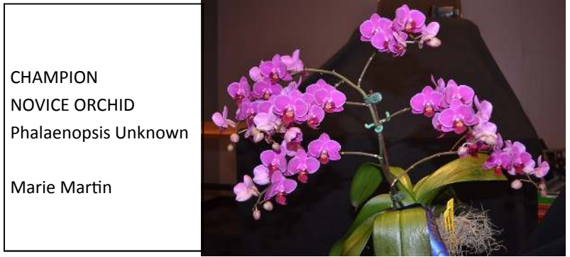
CHAMPION NOVICE ORCHID Phalaenopsis Unknown