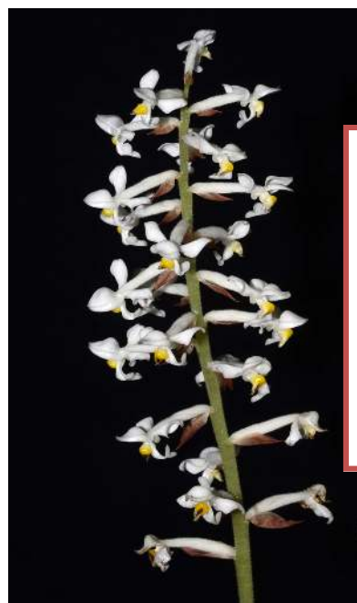
October Novice Orchid of the Night