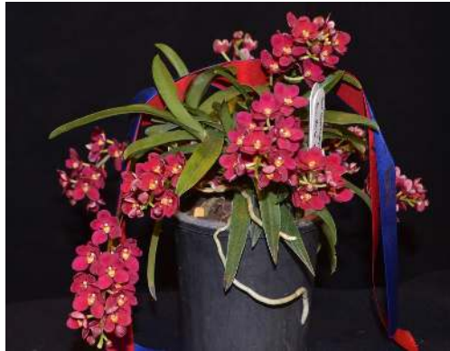
CHAMPION SARCANTHINAE Duno Nicky's Twin 'Eloise' x S. Joy Beet- root Falls