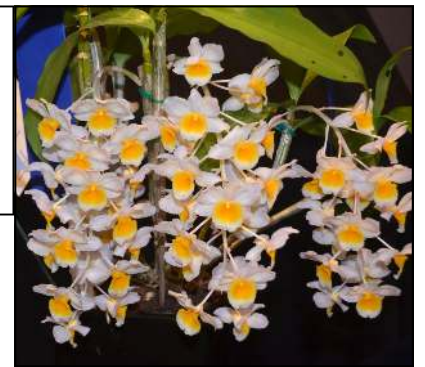
CHAMPION INTERMEDIATE ORCHID Den. Angel Smile 'Kibi'