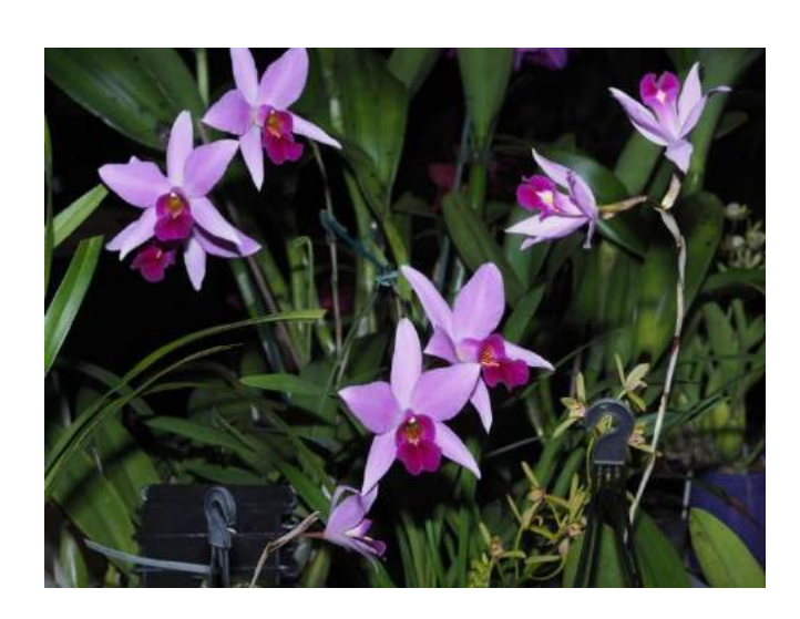
Laelia anceps Disciplinata x Ultimo