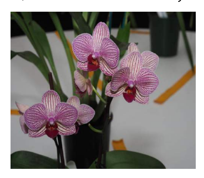
Phalaenopsis Unknown