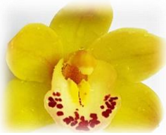
Cymbidium Shoalhaven 'Touch of Class'