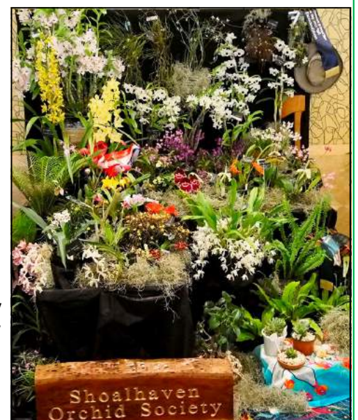
Part of the Shoalhaven display at Bateman's Bay Regional Show in 2015.