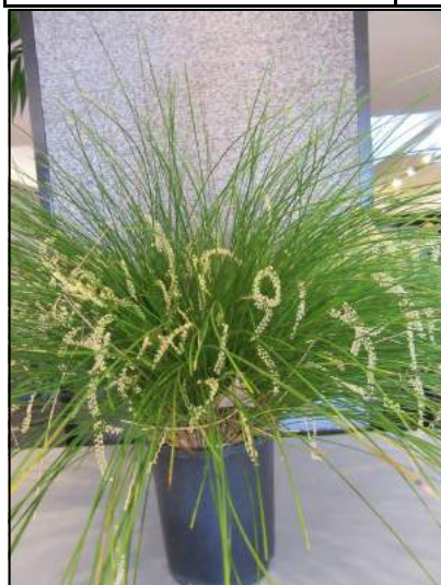
Lawrie Cowell's fine species, Dendrochilum tenellum .