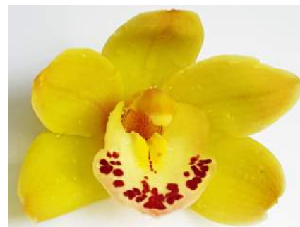
Cymbidium Shoalhaven 'Touch of Class'