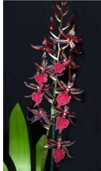
Intermediate Popular Vote Beallara Red Stirbic Helen Douglass