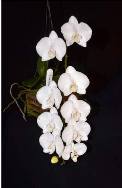
Open Popular Vote and Best Species Phalaenopsis amabilis Brian Phelan