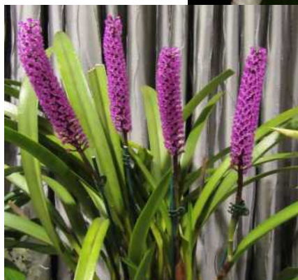
Unusual and well grown Arpophyllum spicata grown by Louise Gannon