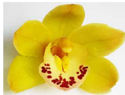
Cymbidium Shoalhaven 'Touch of Class'