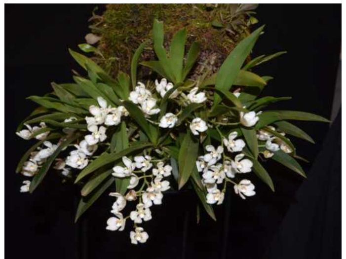
September Open Popular Vote and Species of the Night Phil Harrington's Sarcochilus falcatus