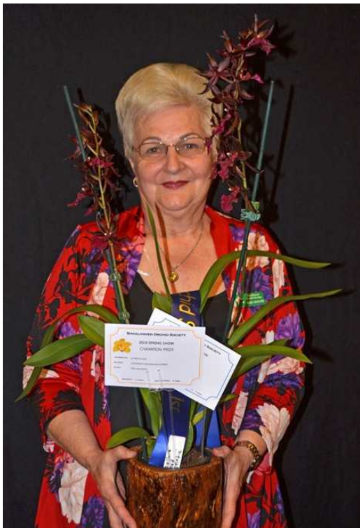
Champion Oncidiinae Hybrid Orchid Bllra. Red Stirbic Helen Douglass