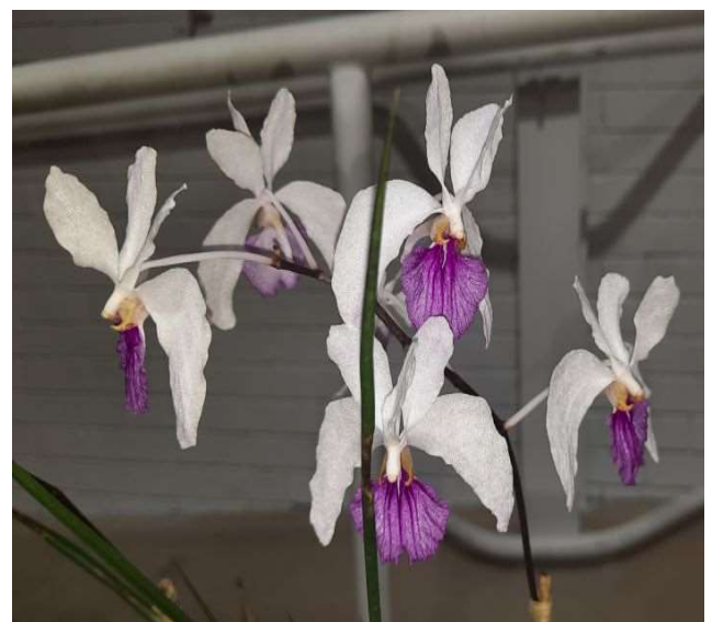
Best Species Holcoglossum kimballianum L. Watkins