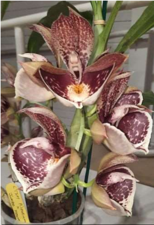
Hybrid of the Night Ctstm. pileatum x Jumbo Heart L. Watkins