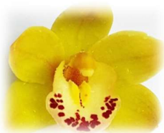
Cymbidium Shoalhaven 'Touch of Class'