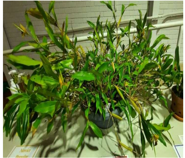
Intermediate Popular Vote Coel. fulginosa R. Wraight